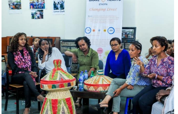
BHE friends and supporters visit our drop in center